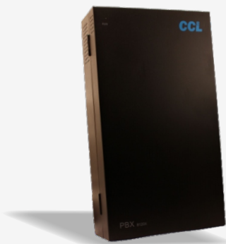
X-Series : 832X & 8120X

Designed, Developed & Manufactured in India