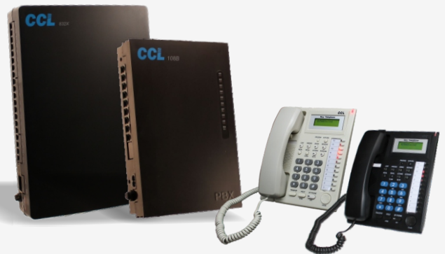
Models from 4 to 500 Extensions